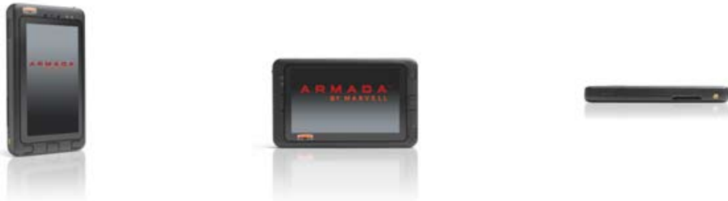
Fig 2. ARMADA 610 Platform Reference Design

The Marvell ARMADA 610 platform offers a compact development platform for creating ARMADA 610 based mainstream Mobile Internet Devices (MIDs), connected consumer products, eReaders, eBooks, tablets, media players and new personal information appliances. The platform demonstrates the ARMADA 610's high performance, low power operation in a compact form factor that is easy for developers to use with powerful expansion options for adding more platform capabilities.