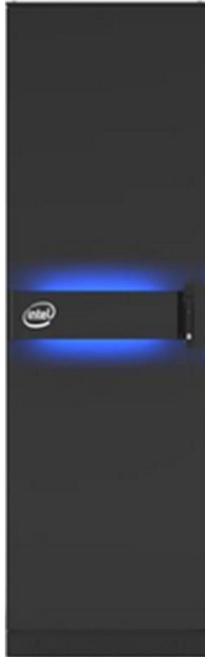
Figure 1. Rack concept