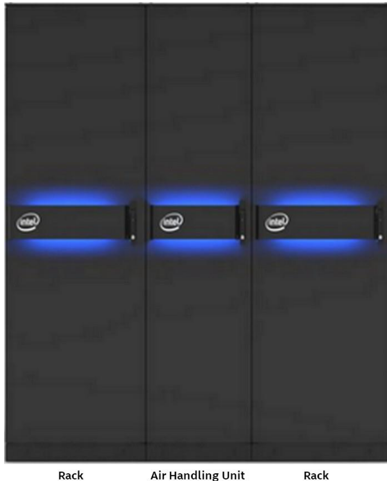
Figure 2. Cabinet concept