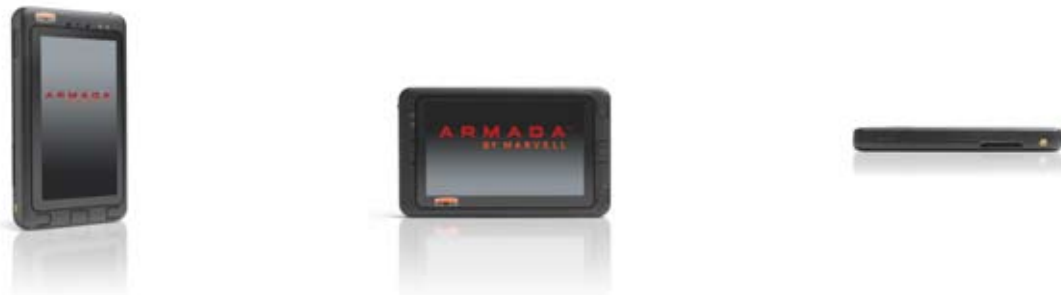
Fig 2. ARMADA 618 Platform Reference Design

The Marvell ARMADA 618 platform offers customers a development platform for creating ARMADA 618 based smartphones. The platform incorporates the ARMADA 618 processor, the Marvell Avastar™ 88W8787 for 802.11n Wi-Fi, Bluetooth 3.0 and FM tuner support as well as a Marvell 3G baseband for high speed cellular data and voice access. The platform demonstrates the full suite of Marvell technologies for smartphone applications in a compact form factor that is easy for developers to use with powerful expansion options for adding more platform capabilities.